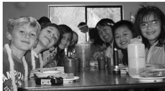
Hillel at Stanford's 9th season of Camp Kesem was attended by 120 campers this year. The week-long program included sports, drama, and arts & crafts activities for everyone.

sold on White Plaza every Friday. This program raised approximately $400 a week for the American Jewish World Service Darfur campaign, and will continue this upcoming school year.