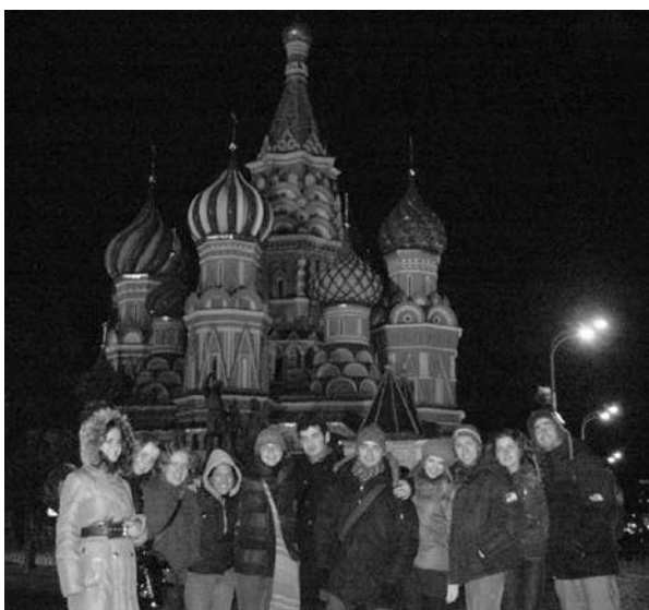
Students pose for a photo in front of the Kremlin during Hillel's Alternative Spring Break trip to Moscow.

Over the March break, Hillel sponsored three service-oriented Alternative Spring Break (ASB) trips. For the first time, Hillel sent eight undergraduate Jewish students to Moscow, where they spent a week with college students from that city's Hillel. Together, they learned about the history of Jews in Russia, met with high-level Russian officials, and volunteered in a Jewish orphanage.