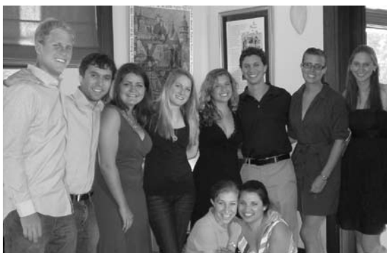
Students gather at Hillel's annual year-end L'Chaim Gala. The evening featured a ceremony to honor seniors and other community leaders, dinner, dancing, and live music from student bands the "Banana Blues" and the "Stanford Klezmer Band".

Hillel at Stanford has faced major challenges in this economic downturn, as have many others. We are fortunate that careful financial management in the past and budget reductions planned for the year ahead have thus far allowed us to continue building thriving Jewish life on campus. That said, the past year required flexibility, creativity, and sensitivity, both organizationally and programmatically.